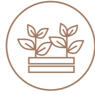
Landscaped communal garden with meeting pod