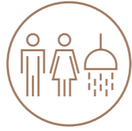
Refurbished W/C's and showers