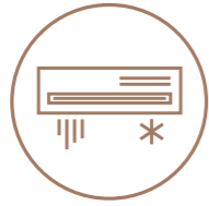
VRF air conditioning