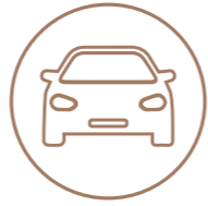
1:229 sq ft car park ratio