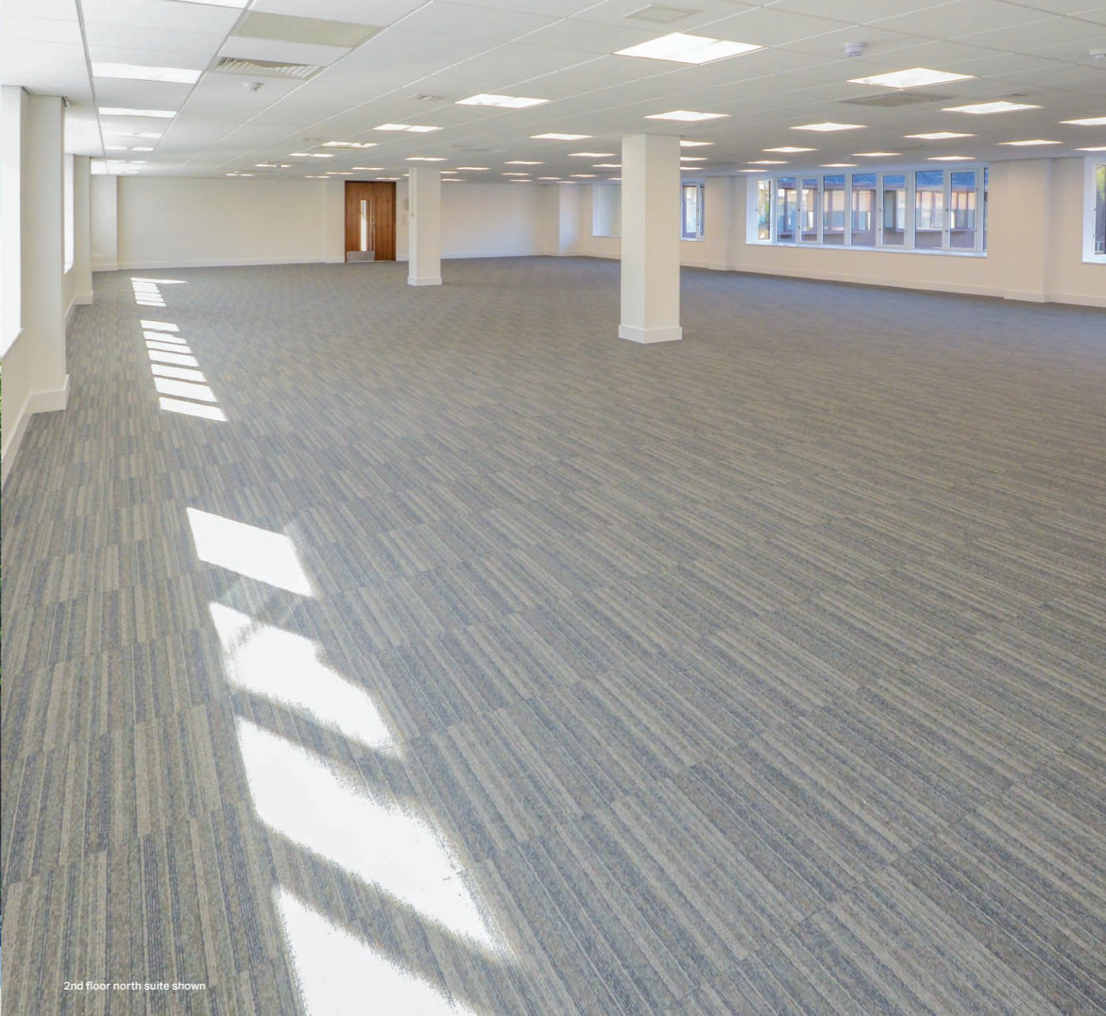
2nd floor north suite shown